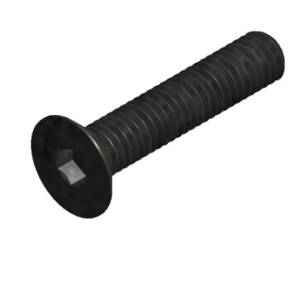
#1 (2) SCREW M6-10x030