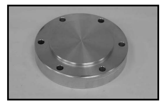
9804 (2) / 1" CV axle spacer