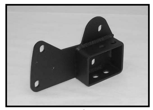
R403 / Qty. 1 Driver side radius arm relocation bracket

If you have any questions or concerns, please feel free to contact Tuff Country or your local Tuff Country dealer.