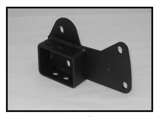
R404 / Qty. 1 Passenger side radius arm relocation bracket