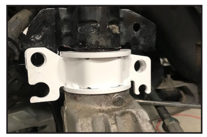
11. Locate (2) 9/16" x 1 1/2" bolts, (4) 1/2" SAE washers, and (2) 9/16" unitorque nuts from hardware bag 42103NB. Install the new hardware into the new strut spacers and torque to 125 ft lbs.