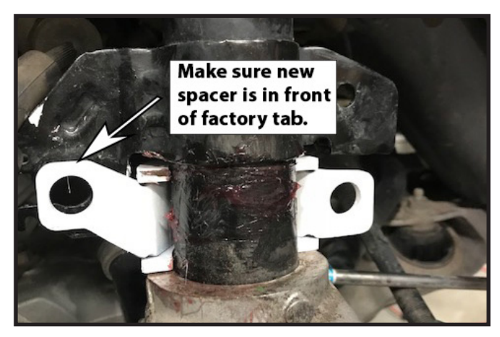
10. Install the outer spacer and ensure all holes align with the inner spacer and factory bracket. The upper and lower "C" shaped pieces should contract each other after wrapping around the body of the strut.