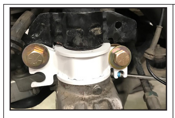
12. Install the OE brake line and ABS wire into the slots of the new strut spacer pieces.