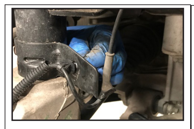
6. Using a dead blow hammer, carefully hit the top of the knuckle until it has slipped down approximately 1 5/8".