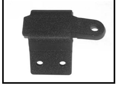
66395-02 / Qty. 1 DS outer bracket