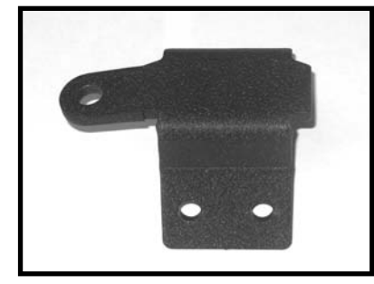
66395-01 / Qty. 1 PS outer bracket