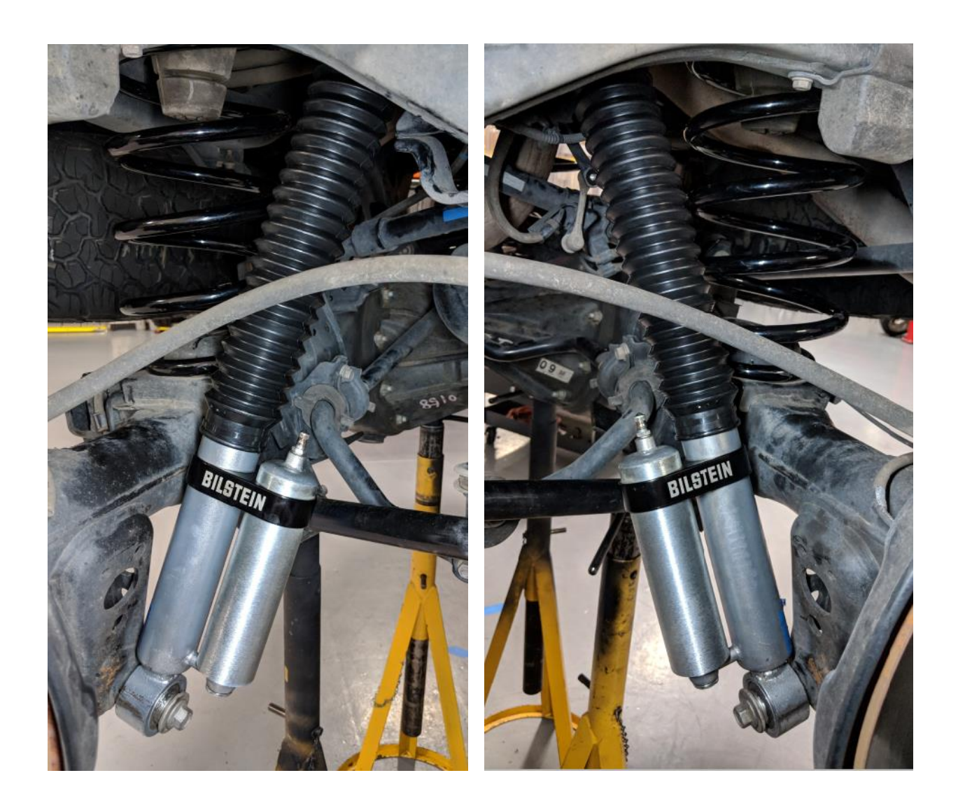
Figure 2 – RIGHT REAR