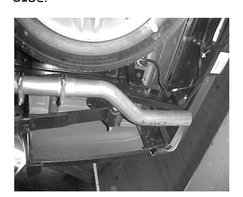
3. INSTALL PASSENGER SIDE OVERAXLE PIPE #C INTO MUFFLER AT LEAST 1 \frac{1}{2} " NO MORE THAN 2". ATTACH WITH HANGER # H AND CLAMP # G.

2. INSTALL HEADPIPE # A AND SECURE IT WITH CLAMP # G. NEXT INSTALL MUFFLER # B WITH THE INLET TOWARDS THE MOTOR. INLET HAS LOUVERS INSIDE FACING TOWARDS THE MOTOR. USE A JACK STAND TO SUPPORT THE MUFFLER. USE CLAMP # G TO SECURE MUFFLER TO THE STOCK PIPE. DO NOT TIGHTEN. INSTALL BAND CLAMP # J INTO RUBBER GROMMET AND INSERT WELDED HANGER, ATTACH WITH BOLT KIT # K. INSTALL # H HANGER TO THE PASSENGER SIDE MUFFLER OUTLET WITH VERTICAL BAR OF THE HANGER TOWARDS PASSENGER SIDE.