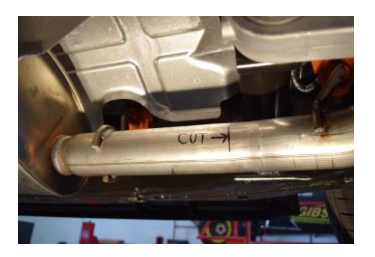
1. To remove the factory exhaust, you will need to use sawsall or hacksaw to cut the exhaust at the place indicated in the picture.

Disconnect the negative battery cable before removal of OEM exhaust. This will allow the computer to reset and recognize the new exhaust. Lay out the exhaust on the floor so it looks like the drawing and compare parts with manual.