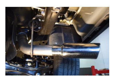
6. Lastly, install exit pipe using the last 3" band clamp and adjust according to your desired tip position. Install tip and tighten all bolts and clamps working from the headpipe towards the exit pipe.

GIBSON EXHAUST systems are designed on a factory stock vehicle. Any aftermarket products installed could increase the sound levels of this Exhaust.