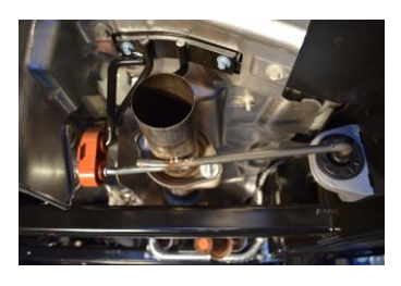
2. To install your new Gibson Exhaust, install the supplied headpipe assembly into the factory hangers. Use Bolt Kit.

4. Install the overaxle pipe into the outlet of the muffler using one of the supplied 3" band clamps.