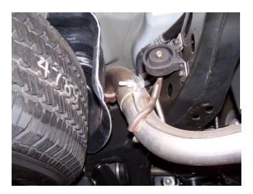
3. For easier removal of the stock exit pipe, remove rear hanger from the frame. Then remove exit pipe and re-install stock rear hanger.

7. Install the over axle tailpipe #C into the extension pipe 1½-2". Use clamp #E to secure. Do not tighten. Insert welded hanger into the rubber grommet.