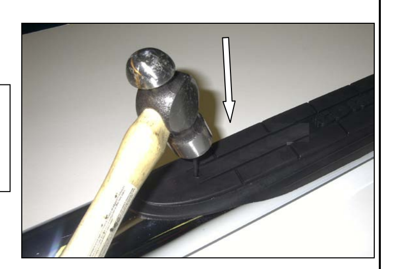
Step-3 Position the replacement step pad on the tube and align the step pad pins with the attachment holes. Press down on the step pad to snap into the holes and install the plastic nails to secure.

Note: Use caution to protect the finish while removing the pad.