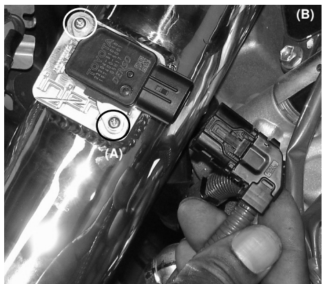
Use the stock screws to secure the MAFS in the sensor adapter (A). Firmly press the electrical sensor connector into the MAFS until it clicks in place (B).