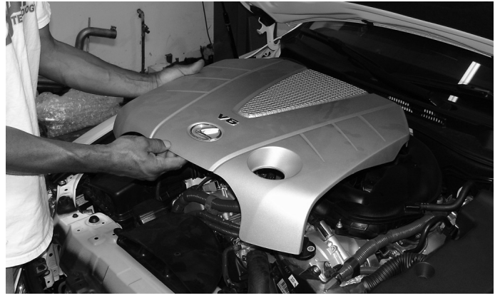
Pull the engine cover from the intake manifold by firmly pulling in a upward motion.