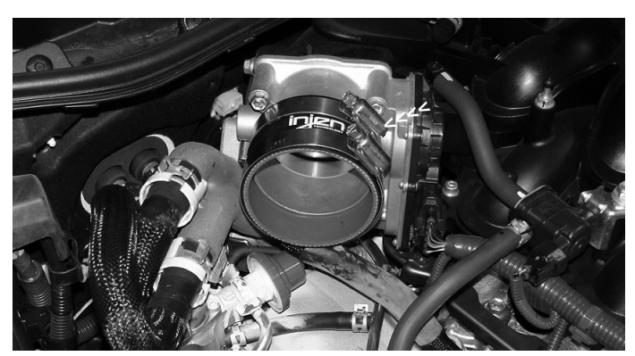
Press the 3\, straight hose over the throttle body and use two power clamps. Use two power-clamps and be sure to tighten the clamp directly over the throttle body end for now.