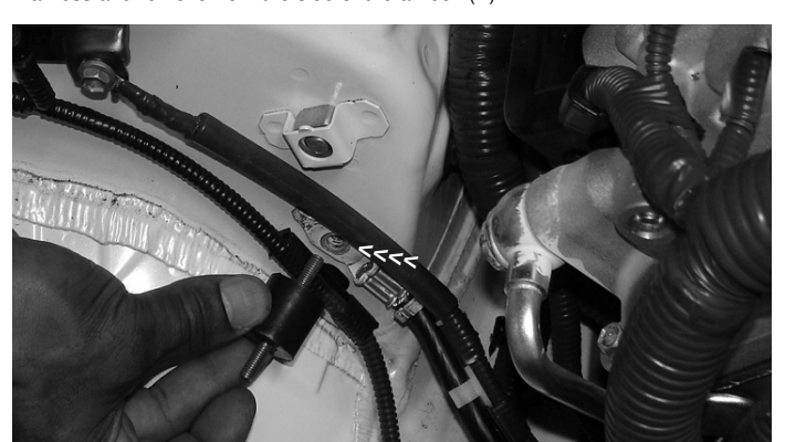
Once the screw has been removed, continue to place the vibra-mount into the pre-tapped hole as shown above.