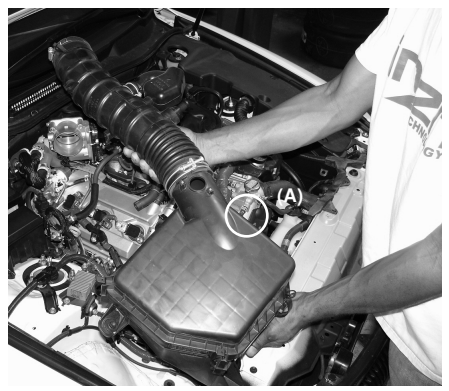
Lift and Pull the air box cleaner from the lower grommets. Before you pull the air box out, unclip sensor harness and remove from the side of the air box (A).