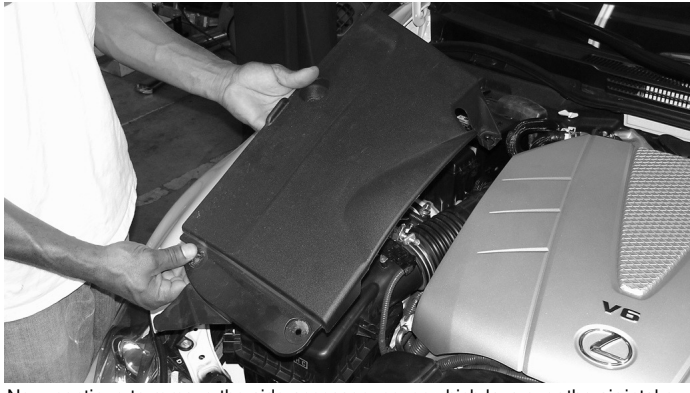
Now, continue to remove the side accessory cover which lays over the air intake box cleaner.