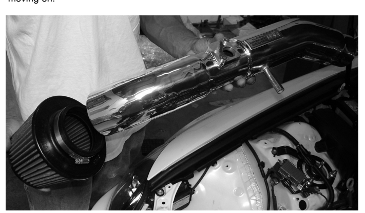
Slip the three inch filter over the end of the intake until it butts up against the filter stops. Once the filter has been firmly placed, continue to tighten the filter neck clamp.