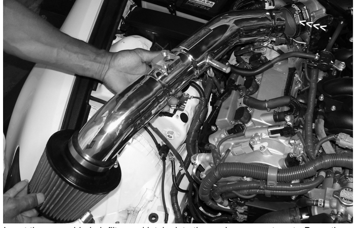
Insert the assembled air filter and intake into the engine compartment. Press the top end of the intake into the 3 throttle body hose, align the intake bracket to the vibra-mount stud and semi-tighten the clamp.