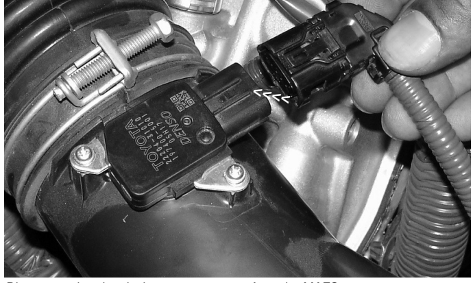
Disconnect the electrical sensor connector from the MAFS.