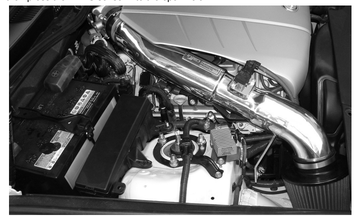
Align the entire intake for the best possible fit. Be sure the intake does not rub or hit any moving parts in the engine compartment, once you have checked the entire intake, continue to tighten all nuts, bolts and clamps.