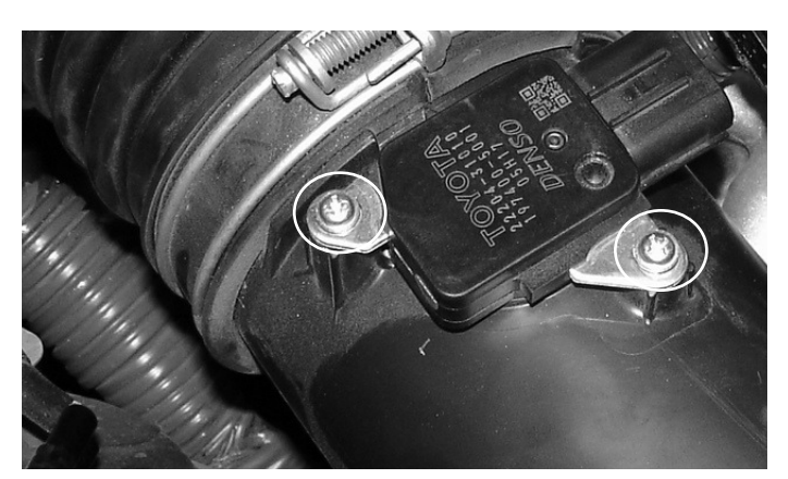
Loosen and remove the two sheet screws that fasten the MAFS to the sensor housing.