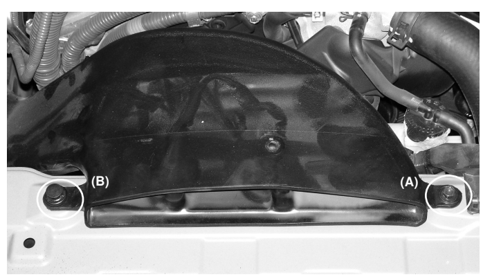
Loosen and remove one bolt (A) depress and pull the last remaining plastic clip (B) now holding the air scoop in place.