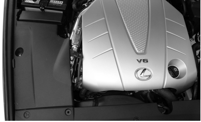
Once the intake has been fitted for a perfect fit, continue to replace the plastic air intake scoop, passenger side accessory cover and the engine cover.