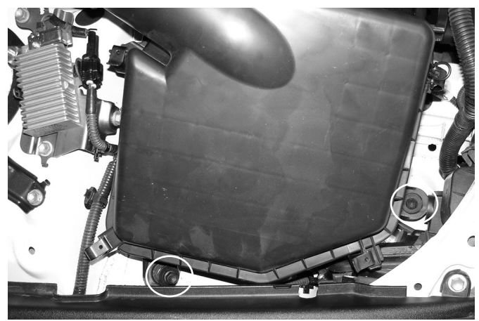
Loosen and remove the two bolts that secure the air box cleaner over the grommets.