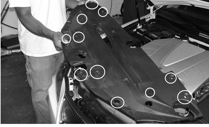
Depress center stem on the plastic clip, remove all 11 clips from the top shroud. Once all clips have been removed continue to remove the plastic front shroud.