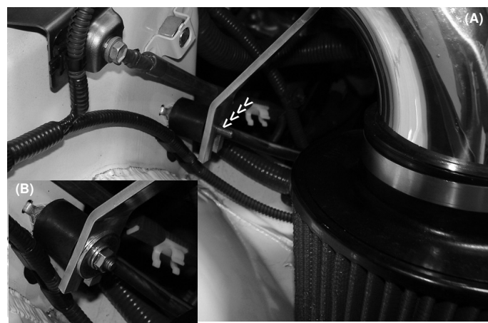
The intake bracket is aligned to the vibra-mount stud (A). Use the m6 flange nut and fender washer to secure the intake in place (B).