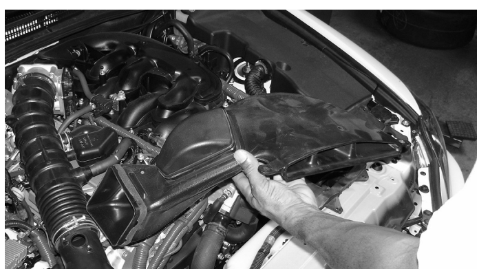
The front air scoop is now removed from its current location for now.