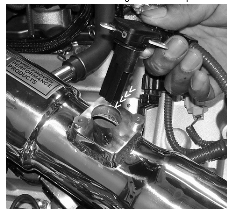
Prior to inserting the MAFS into the machined adapter, use a light weight oil around the O-ring then press the MAFS sensor into the open hole.