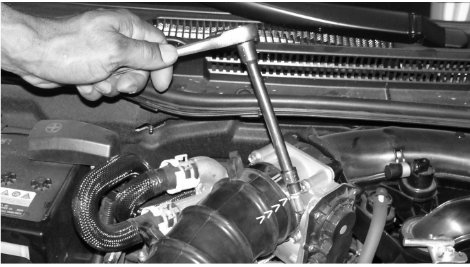
Loosen the only remaining metal clamp which secures the air duct to the throttle body as shown above.