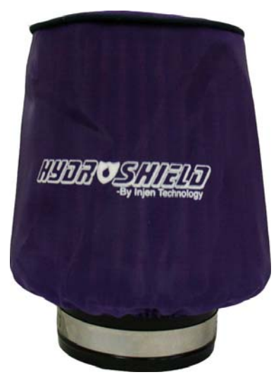
Hydro Shield Sold Separately