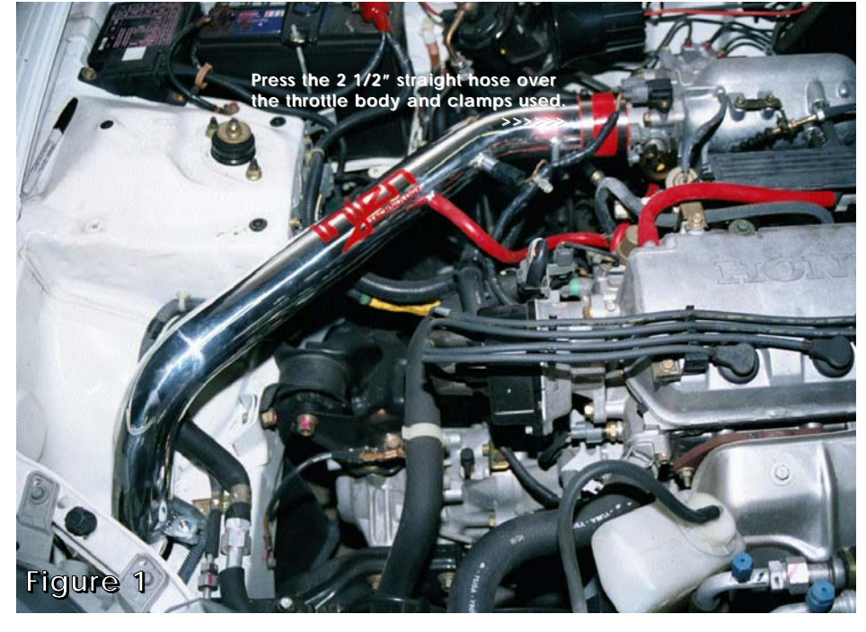
Now available, Hydro Shield by Injen Part Number X-1033

Injen Technology 244 Pioneer Place Pomona, CA 91768 USA