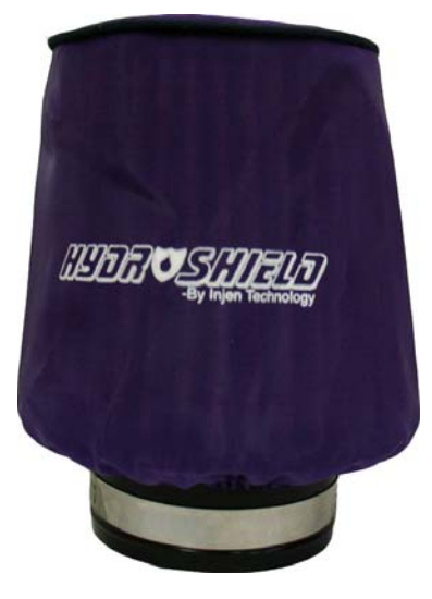
Hydro Shield Sold Separately