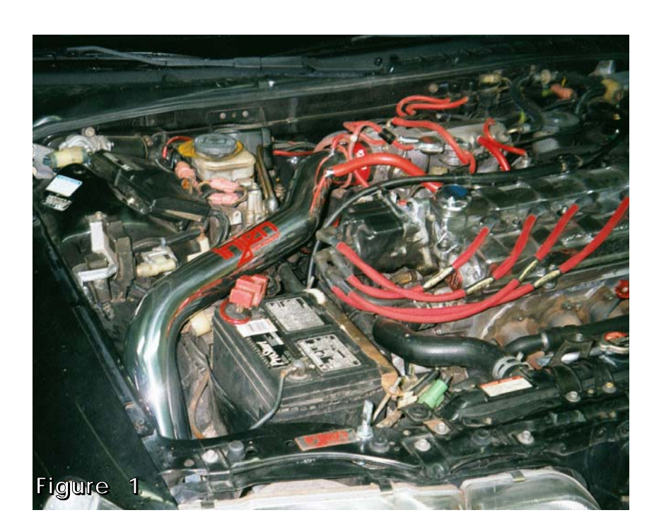
Now available, Hydro Shield by Injen Part Number X-1033

congratulations! You have just purchased the best engineered, lyno-proven cold air intake system available. Please check the contents of this box immediately. eport any defective or missing parts to the Authorized Injen echnology dealer you purchased this product from. efore installing any parts of this system, please read the instructions noroughly. If you have any questions regarding installation please contact the dealer you purchased this product from. nstallation DOES require some mechanical skills. A qualified nechanic is always recommended. Do not attempt to install the intake system while the engine is hot. he installation may require removal of radiator fluid line that may e hot. njen Technology offers a limited lifetime warranty to the original burchaser against defects in materials and workmanship. Warranty laims must be handled through the dealer from which the item vas purchased. njen Technology 244 Pioneer Place Pomona, CA 91768 USA