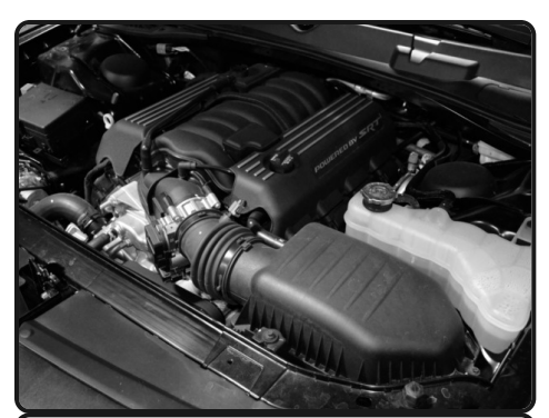
1. Stock intake system shown.