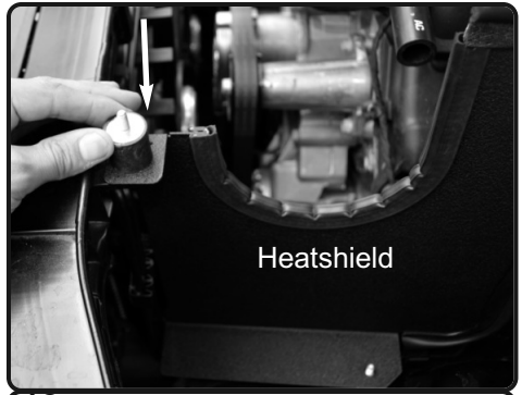
12. Secure the the front tab using provided M6 vibramount to the thredded insert, secure and tighten.