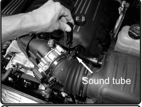
3. Loosen the clamp on throttle body using 8mm nut driver.