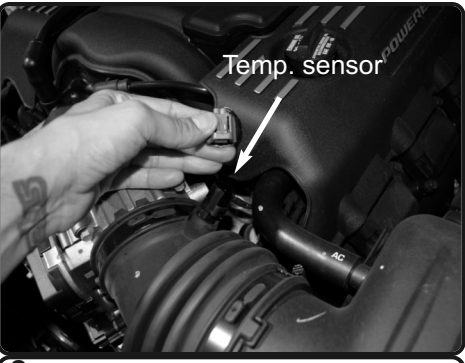
2. Disconnect the Temperature sensor harness.