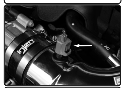
20. Re-connect the temperature sensor harness.