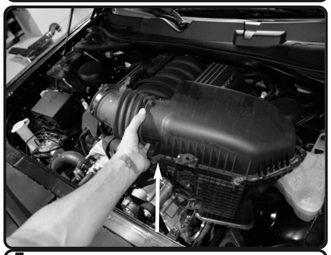
5. Carefully lift up and remove the stock air box assembly.