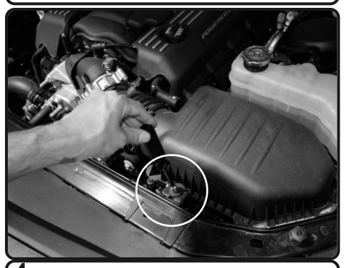
4. Loosen the bolt holding in the airbox using 8mm nut driver.