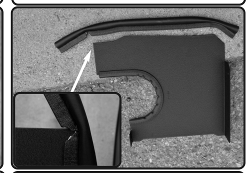
10. Install the Rubber trim to the side of the heatshield. NOTE: For easier clean install notch corners to fit with pliers or cutters.