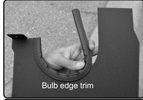
9. Install the bulb edge trim to the cut out.