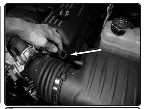
7. Pull back crank case line from airbox fitting.