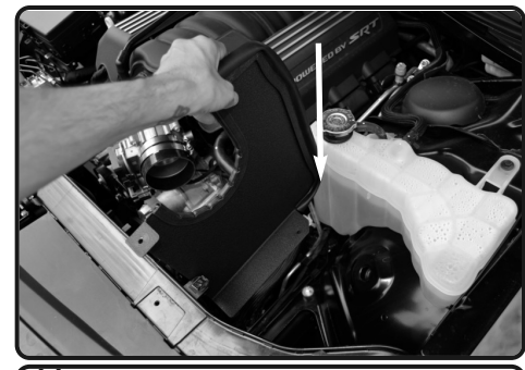
11. Now install the heatshield into the vehicle and position.