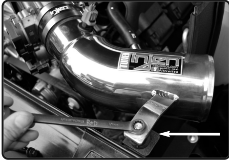
21. Tighten the vibramount using 10mm socket or wrench.