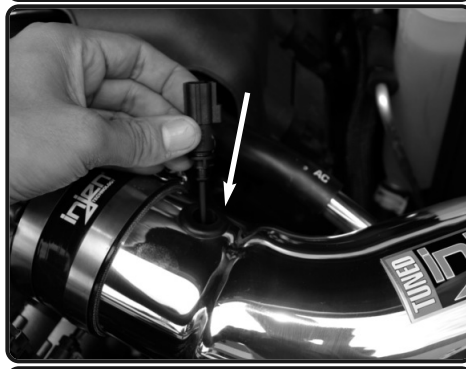
19. Now install the temperature sensor into the grommet and secure.