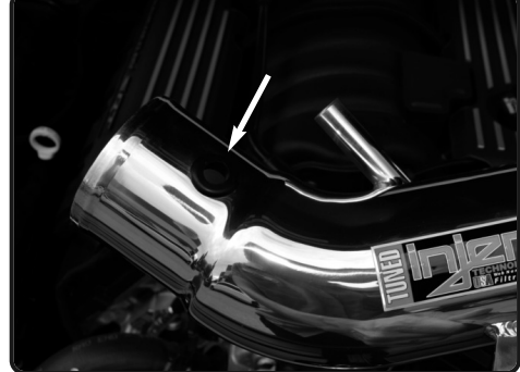
14. Install the provided grommet to the hole on heatshield.