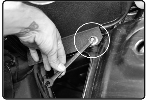
22. Secure the bottom of the heatshield using 10mm socket or wrench.