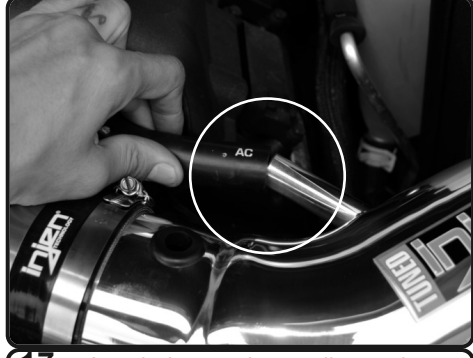
17. Attach the crank case line to the fitting on intake tube.