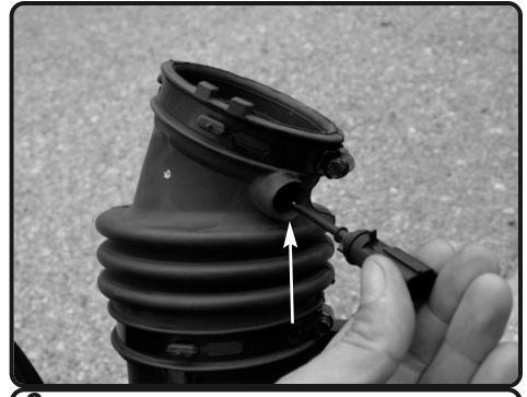
6. Now carefully remove the temperature sensor from the intake tube.