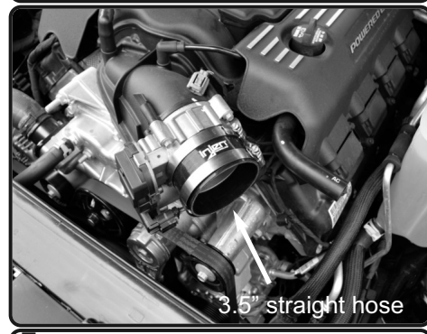
7. Install the 3.5" straight hose to the throttle body. Tighten clamp on throttle body using 8mm nut driver.