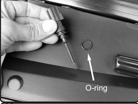
18. Remove the o-ring from the temperature sensor.