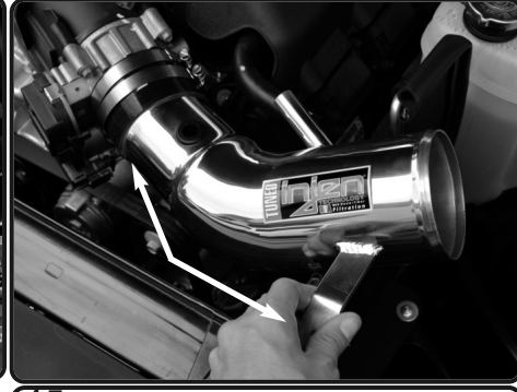
15. Now install the intake tube into vehicle and position tube to hose and bracket to the vibramount from step 12.