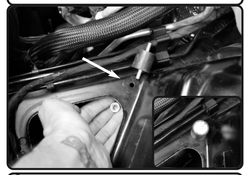
8. Install the vibramount to the hole on frame. Use the M6 nut and secure.