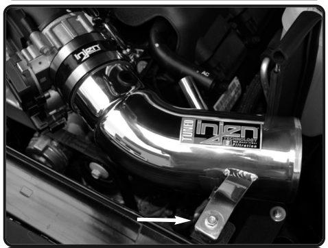
16. Now secure the bracket using provided M6 nut and fender washer.