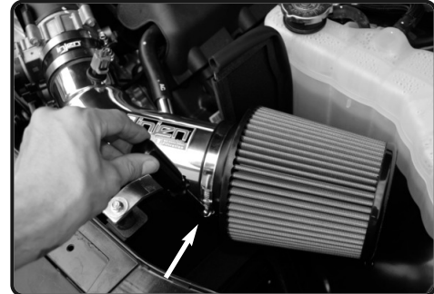
23. Now install the air filter to the intake tube, secure and tighten using 8mm nut driver. Tighten all clamps using 8mm nut driver.