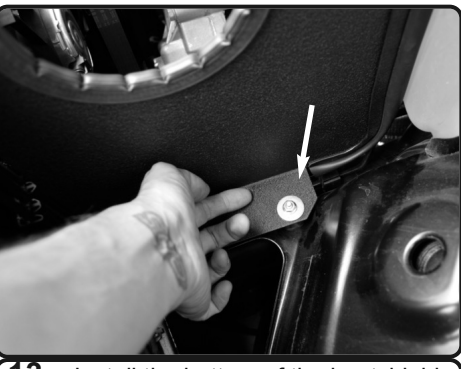
13. Install the bottom of the heatshield to the vibramount from step 8.