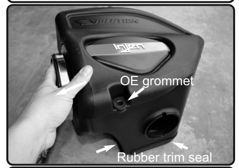
9. Remove the factory rubber grommet with washer from OEM airbox and install to the new injen airbox. Attach the Rubber trim to the bottom of the air box.