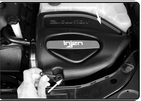
10. Install the air box assembly into the vehicle. Secure using OEM screw. Make sure the nipple fitting on back side of injen airbox is seated in the OEM grommet on fender well.