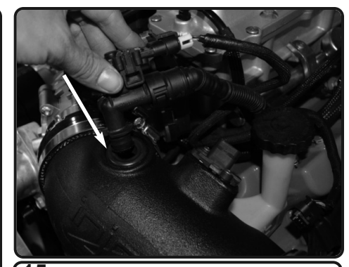
15. Now install the crankcase line into the grommet.