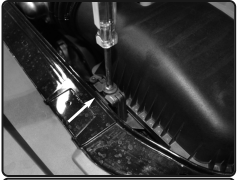
5. Loosen the bolt holding in the airbox using 8mm nut driver.