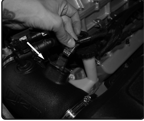
17. Connect the MAF sensor harness.