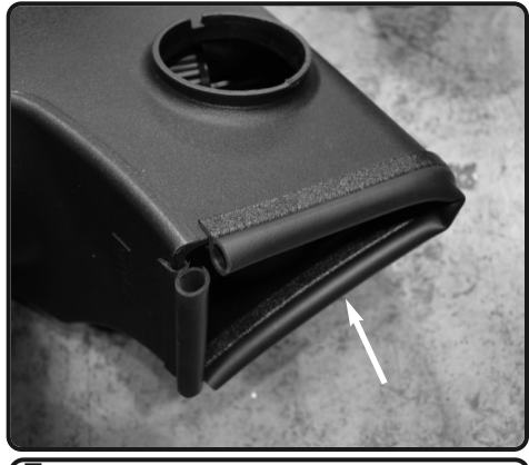
7. Now carefully remove the temperature sensor from the intake tube.