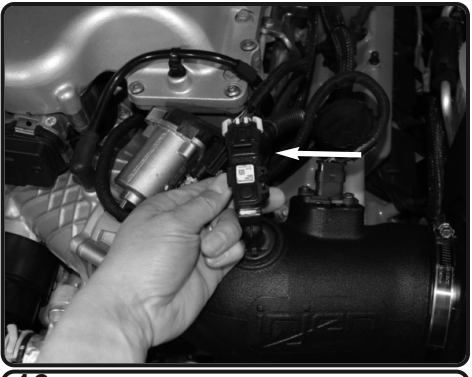
16. Secure and make sure the unit is pushed closes to the throttle body. This will clear the hood and not hit.