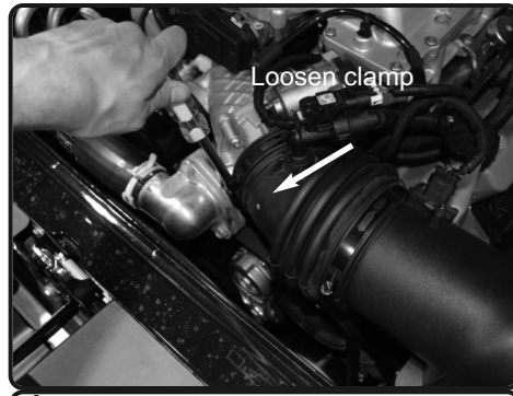
4. Loosen the clamp on throttle body using 8mm nut driver.