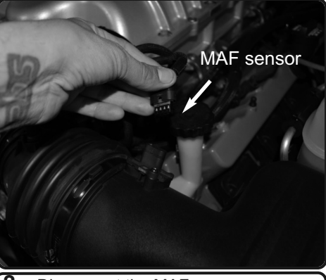
2. Disconnect the MAF sensor harness.