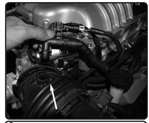
3. Pull back crank case line from intake tube fitting.