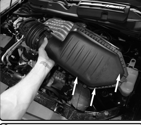
6. Carefully lift up and remove the stock air box assembly.