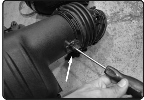
11. Loosen and remove the MAF sensor out of the airbox.