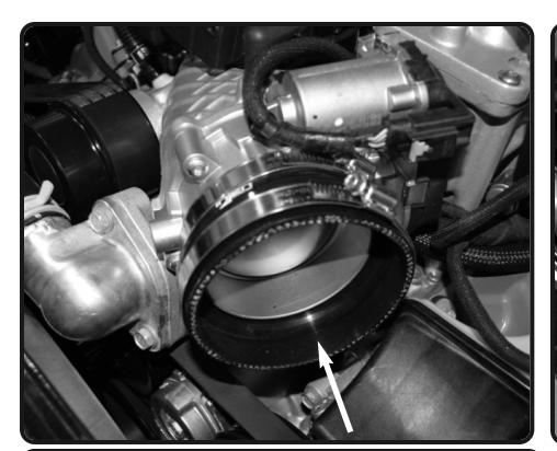
13. Install the step hump hose to the throttle body. Install the intake tube and position for fit.