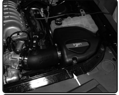
18. Verify and check all components are tighten and secured.