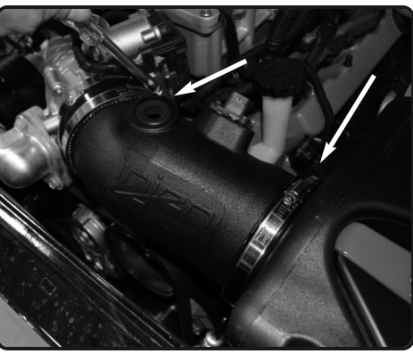
14. Adjust for fitment and tighten all clamps using 8mm nut driver.