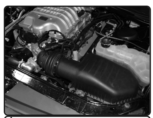
1. Stock intake system shown.