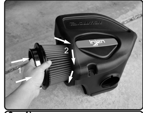
8. 1)Insert twist lock filter to the air box. 2)Once seated, rotate in either direction 1/4 turn till filter locks.